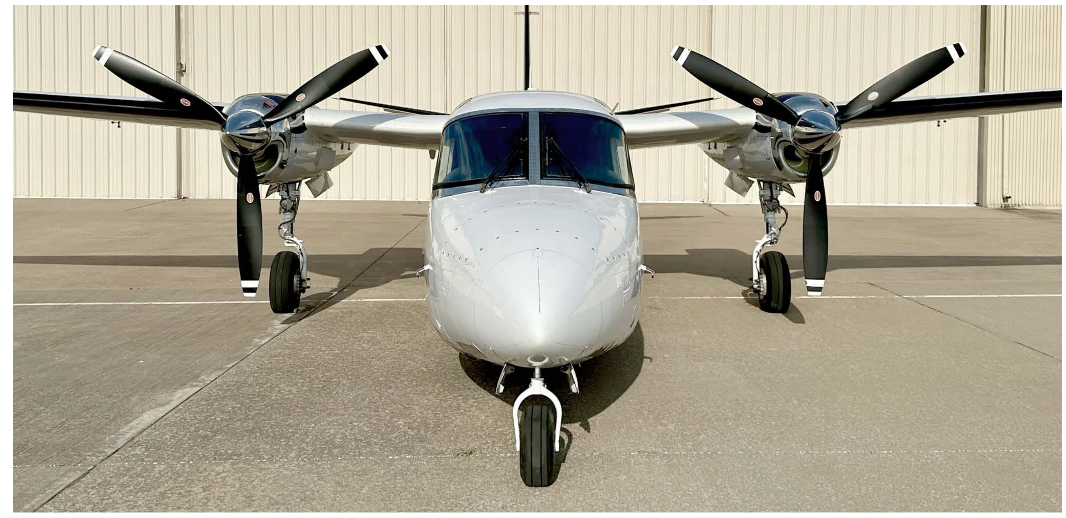
Specifications and/or descriptions are subject to verification. The aircraft is subject to prior sale, lease, and/or removal from the market without prior notice.