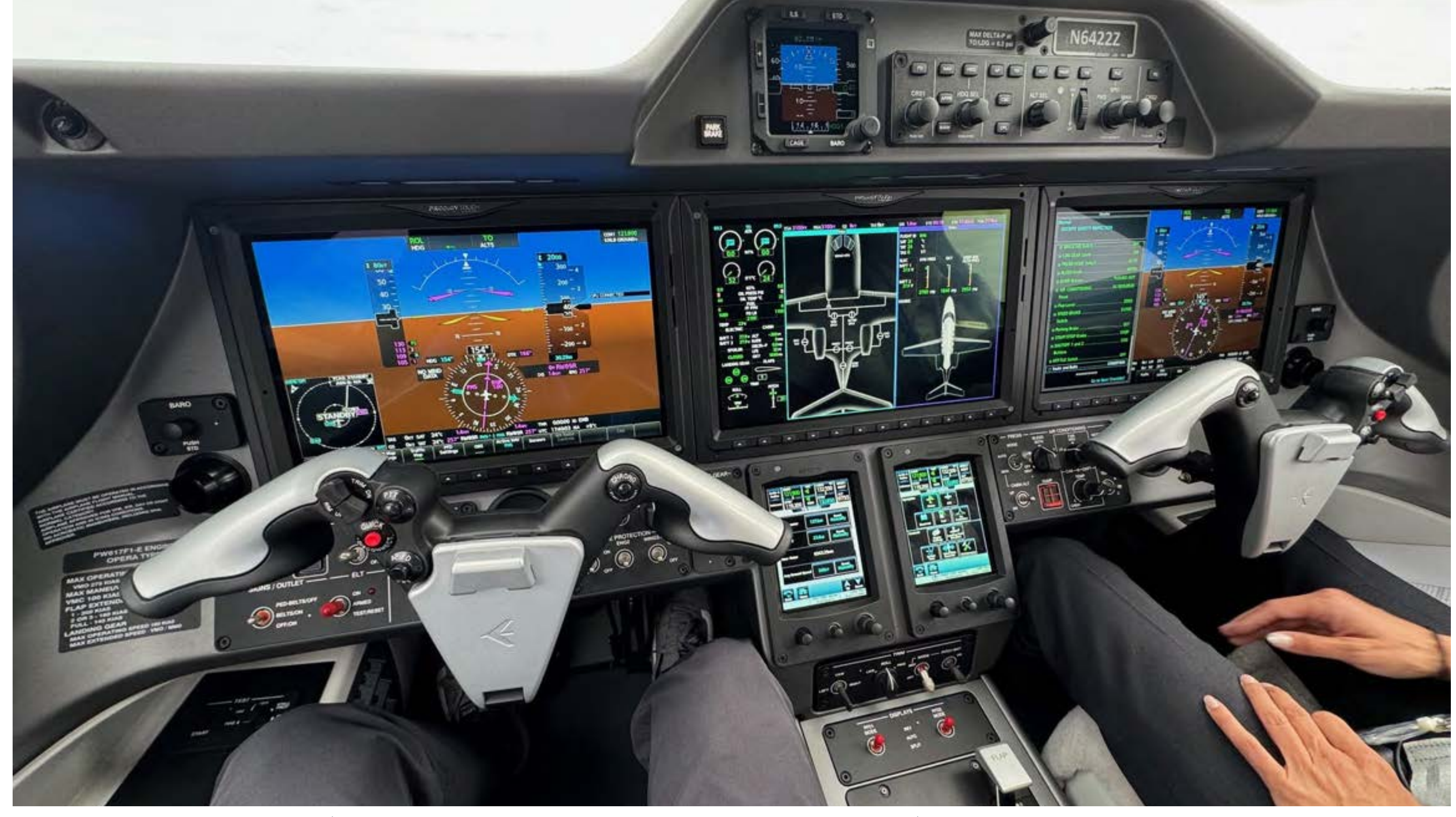
Specifications and/or descriptions are subject to verification. The aircraft is subject to prior sale, lease, and/or removal from the market without prior notice.