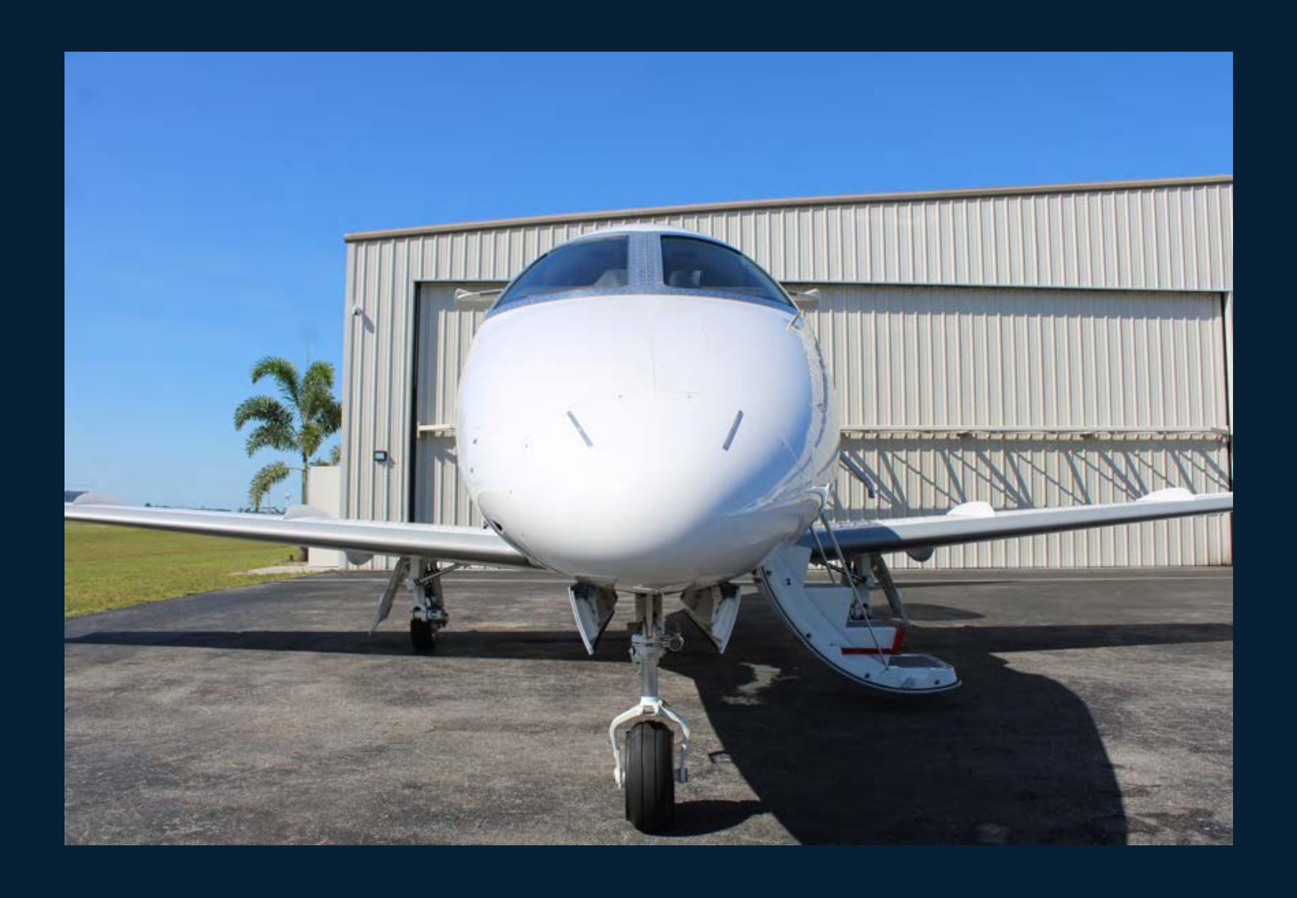
Currently available for showing at Naples Jet Center Naples, FL