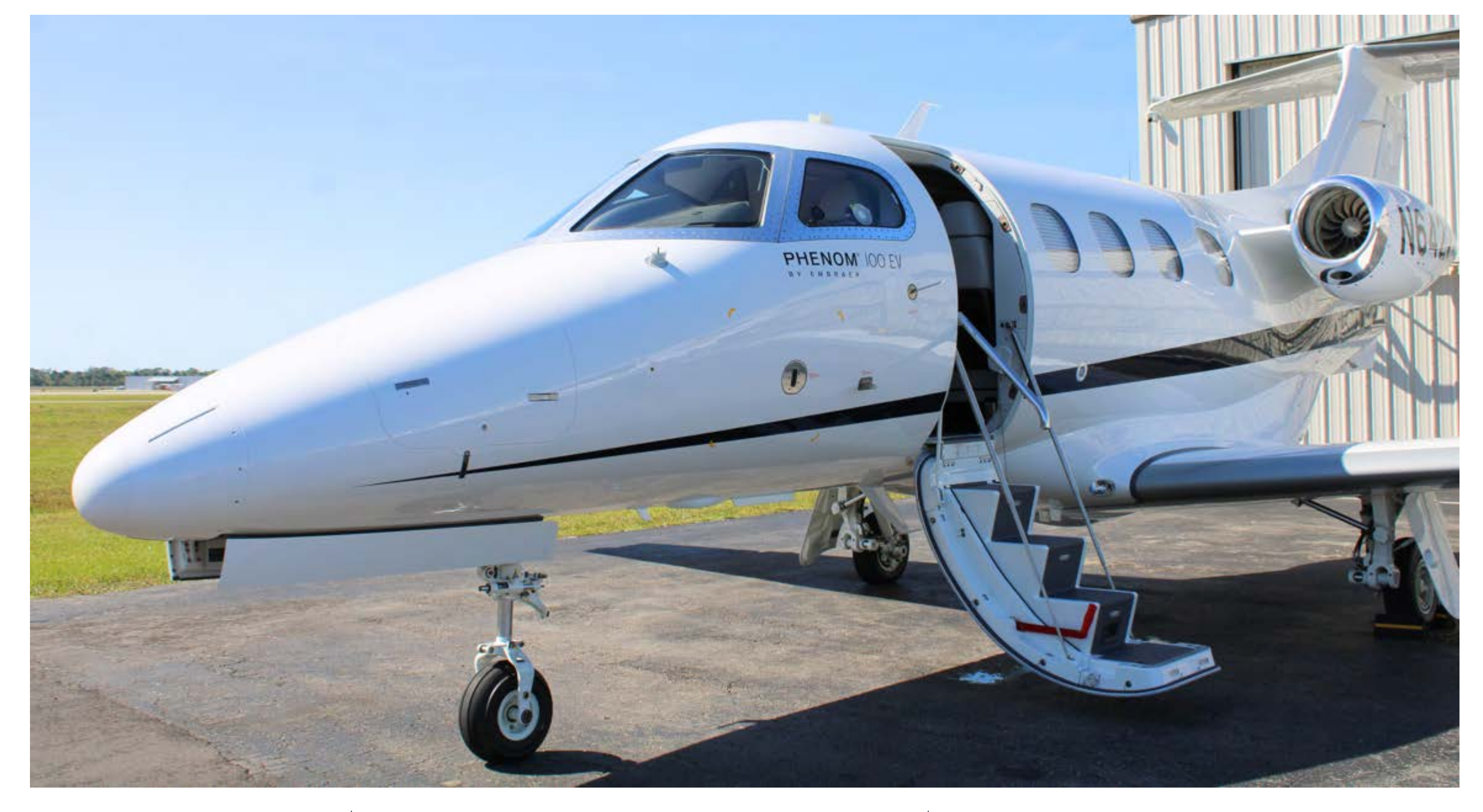
Specifications and/or descriptions are subject to verification. The aircraft is subject to prior sale, lease, and/or removal from the market without prior notice.